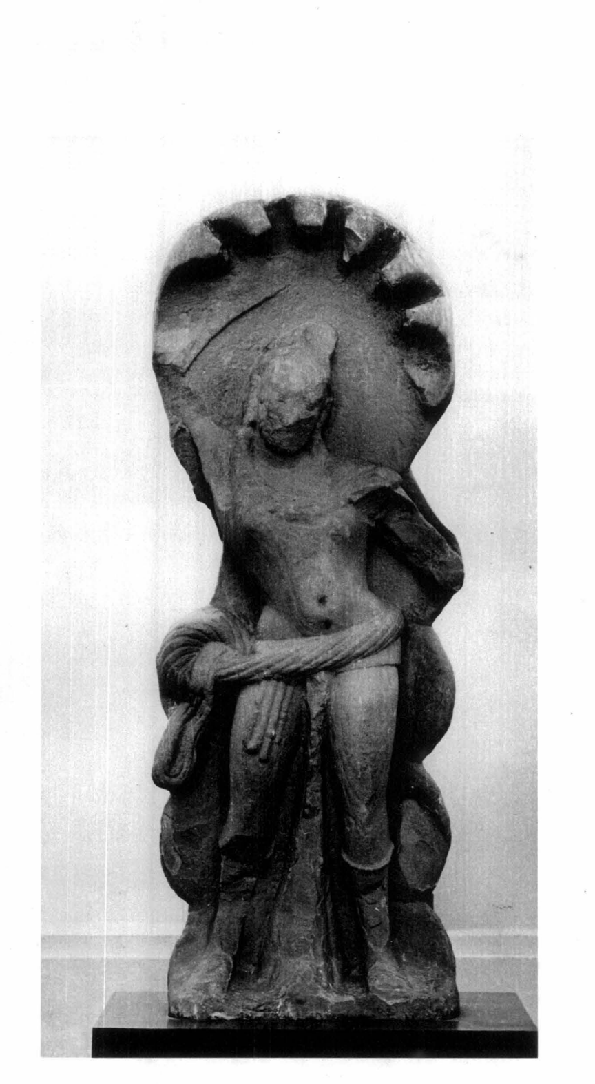
PLATE XIX: Chhargaon Naga Image.