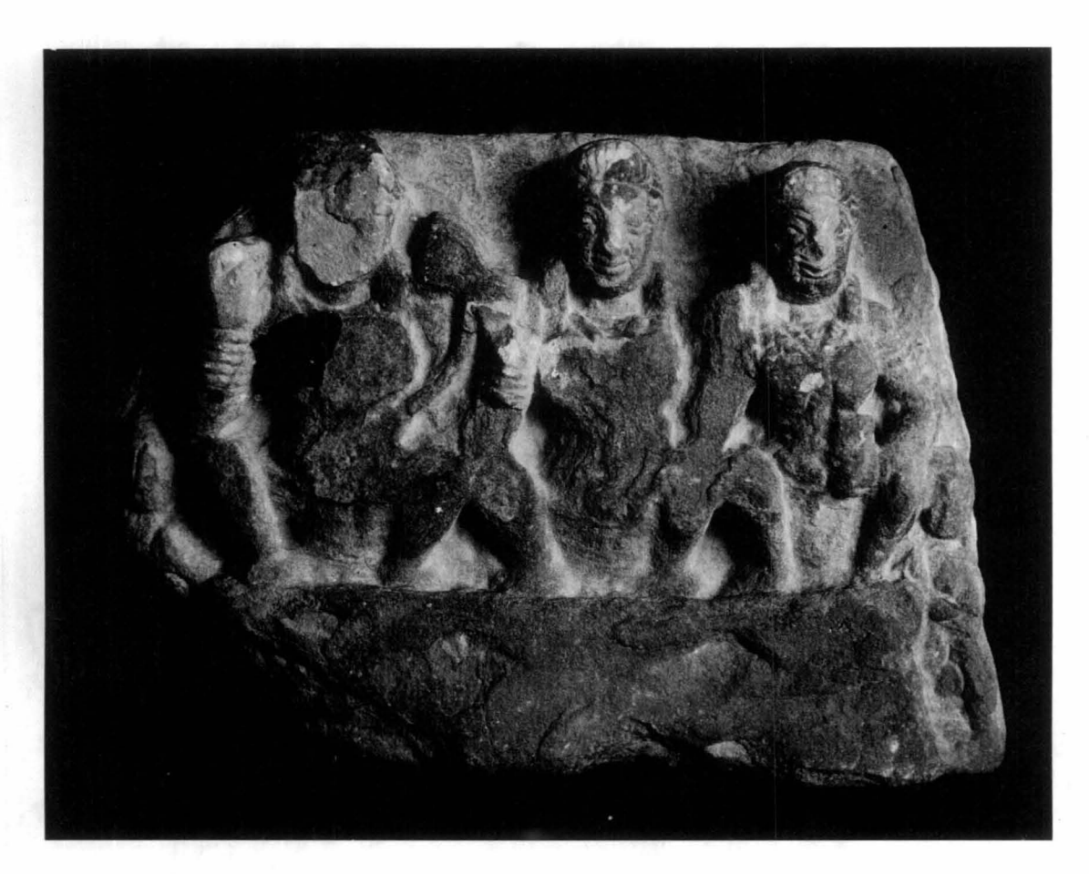
PLATE XVIII: Three Matrikas on a panel– Peepal Wala Well, Mathura City