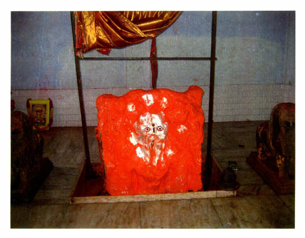
PLATE XXI : Sonkh–A present day Camunda temple stands right beside the Apsidal Temple No. 2. The image depicted as Camunda here is in fact a Kushana period Naga image smeared with vermillion and worshipped as the goddess now.