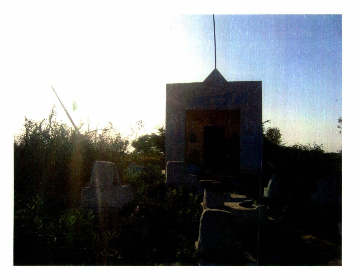
PLATE XXIII: Devi thanas at a local temple dedicated to Goddess Durga at the site of Mora.