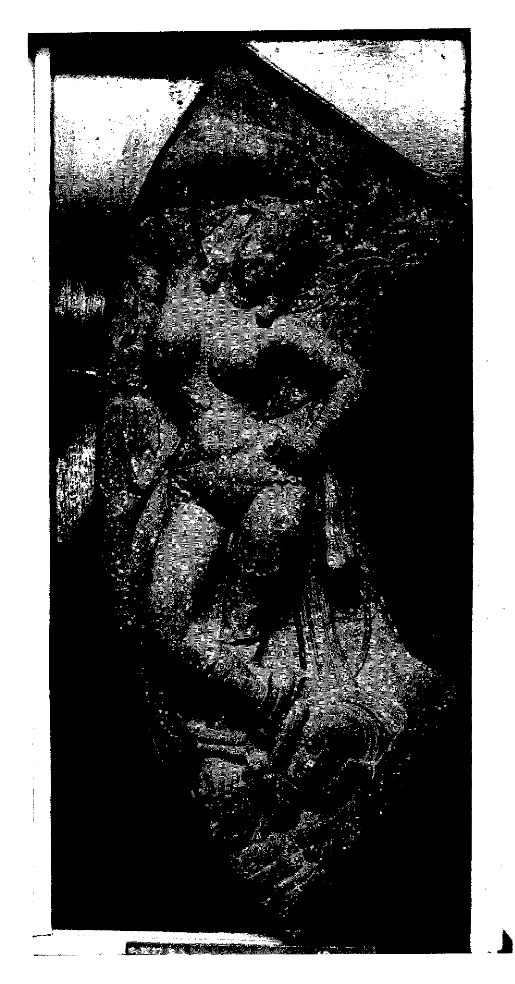
PLATE XVII: Shalabhanjika figure–Sonkh.