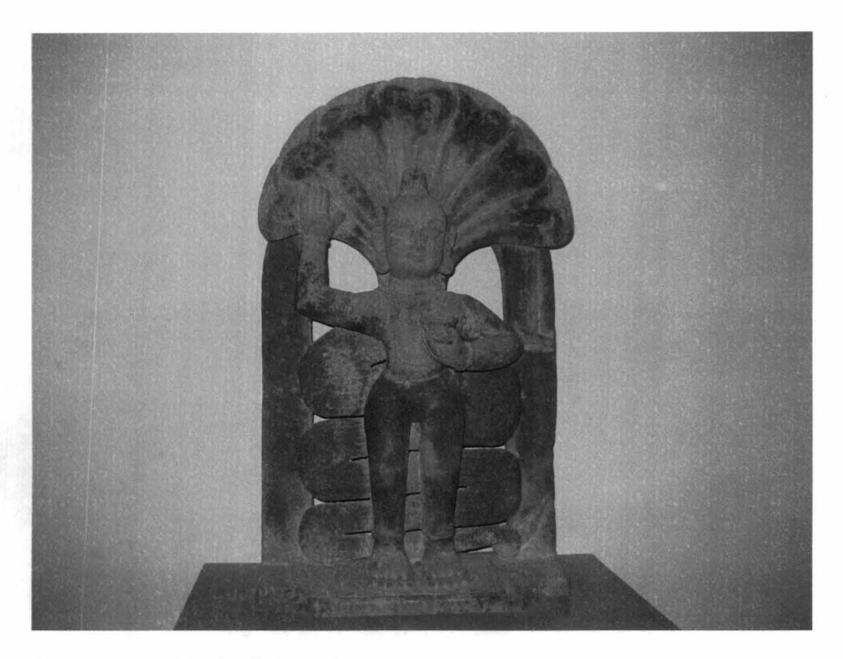
PLATE XX: Modern day Balrama image.